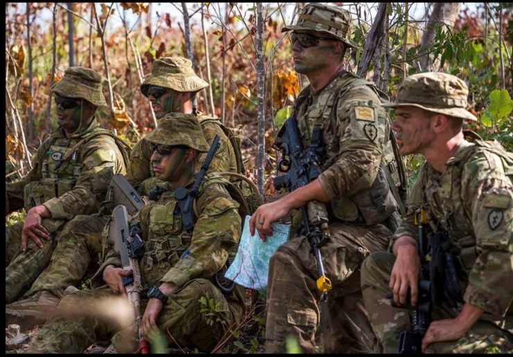
Diggers from The Australian Army's 1st Brigade and US Army G.I.s from 25th Infantry Division wait for the next iteration of their training during Exercise Southern Jackaroo, Northern Territory.

'Hurry Up and Wait!' Different Armies, same language. Japanese troops board a USMC MV-22 in Australia