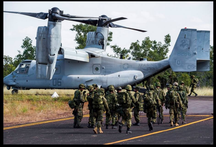
Japanese troops from the Japan Ground Self-Defence Force board an MV-22 Osprey tilt-rotor aircraft of the United States Marine Corps

For more great images, go to 1st Brigade - Australian Army Facebook page.