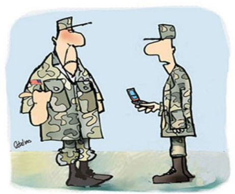
"How about if I just follow you on Twitter instead?"